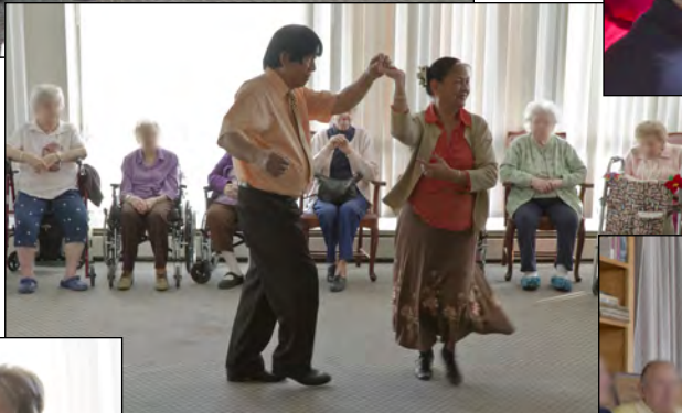
Even pesky columns in the middle of an already small dance floor won't deter our Outreach members from their entertaining for the seniors.