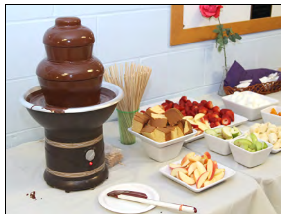
Chocolate lovers — our traditional fountain and lots of goodies for dipping await you at NHABDA's 26th Anniversary Ball on Oct. 19th at Pinkerton!