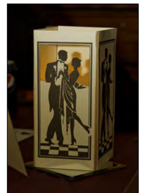
Beautiful candle-lit center- pieces by Virgie Beacom.