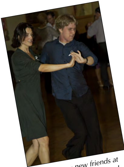
New faces = new friends at NHABDA monthly dances!

ADDRESS SERVICE REQUESTED TIME SENSITIVE MATERIAL!