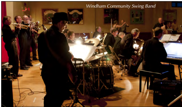
Windham Community Swing Band

ADDRESS SERVICE REQUESTED TIME SENSITIVE MATERIAL!