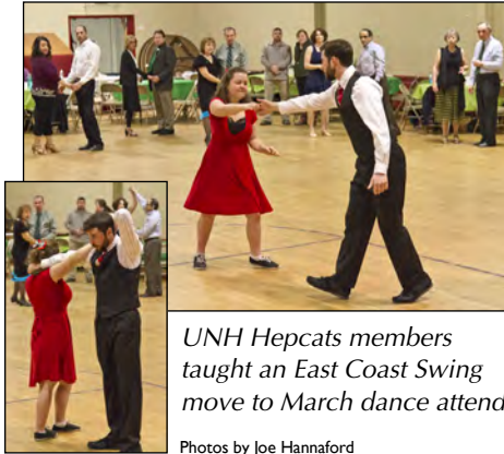
UNH Hecpats members taught an East Coast Swing move to March dance attendees.

ADDRESS SERVICE REQUESTED TIME SENSITIVE MATERIAL!